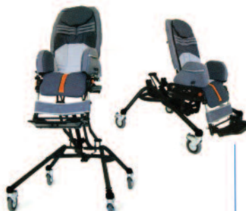
856 FEEDING BASE (only for indoor use)