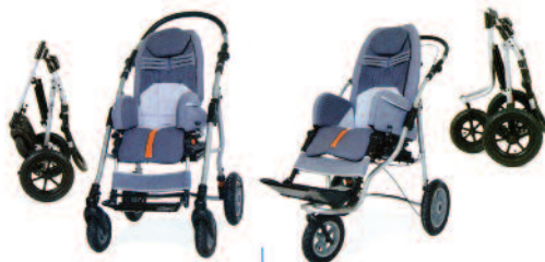
869 FOUR WHEEL BASE