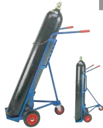
Series AR Adjustable rake back Max o/a front-rear 1350 mm