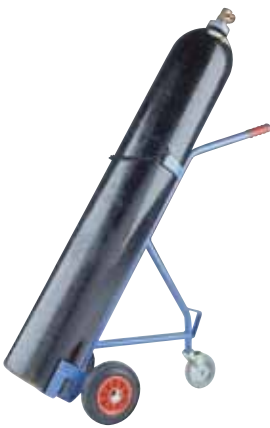
Series FP Fixed single position Max o/a front-rear 1200 mm