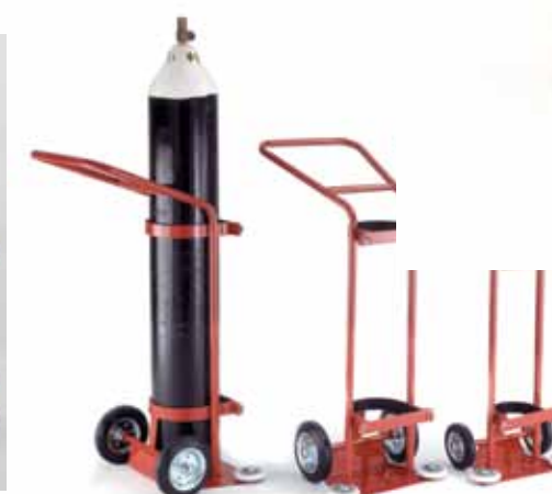
Fitted with revolving protective buffers as standard