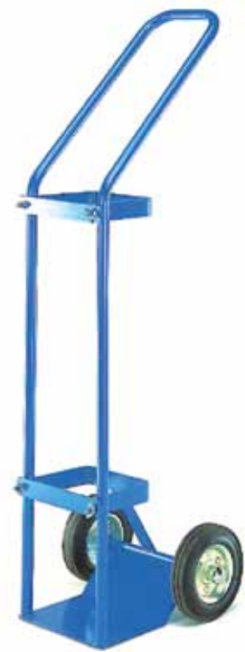
SC143 Loop handle models Loop handle and steel retaining bar.

Cylinder sizes: 230 & 275 mm diameter. Wheels: 200 mm dia. solid rubber tyred roller bearing wheels. Finish: Blue epoxy.