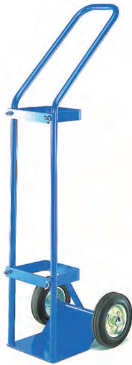
SC143 Loop handle models Loop handle and steel retaining bar.